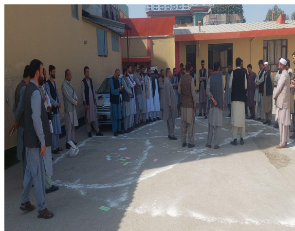
Training for ACRLP's facilitating partner, Aga Khan in NorthEast, September 28- October 04, 2022