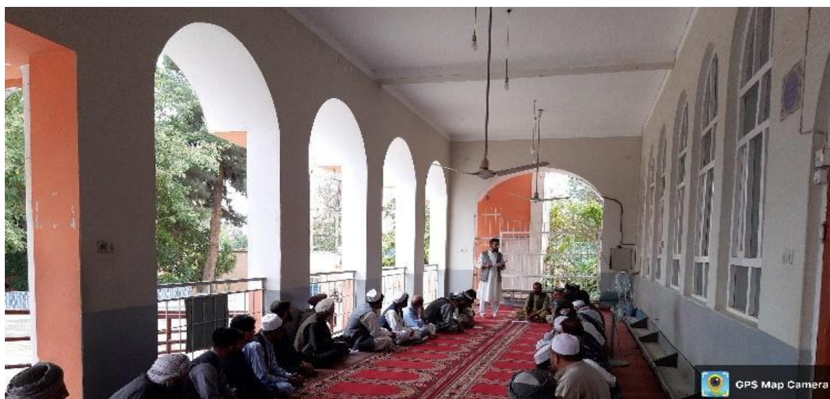
ACRLP Kunduz Male Community Liaison in August 2022

labourers and labour days will be reported upon the completion and handover of the sub projects.