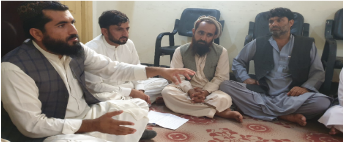
Head of Jalalabad Municipality District 2 shared information with the CRLP team and GA Heads on 24 August, 2022 in Nangarhar