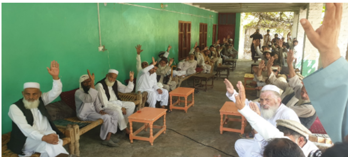
Jalalabad Municipality, in District 7-Head of Guzar assemblies met to discuss projects proposed by the community