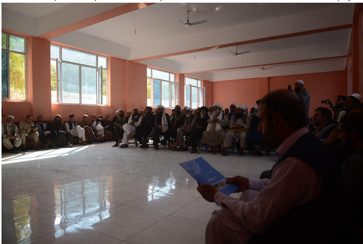
Rehabilitation of Plum Concrete surface street of Imam Baqir Mosque with 630 M length in District -1 of Kabul City on Sep. 05, 2022

On the average, around 175 labourers (skilled and unskilled) and 10,000 labour days are expected to be generated for each of the ongoing sub projects under C2. As such the total of labourers and labour days for Kabul is estimated 175 \times 5 = 875 and labour days are 50,000 respectively. The actual number of labourers and labour days will be reported upon the completion and handover of the sub projects.