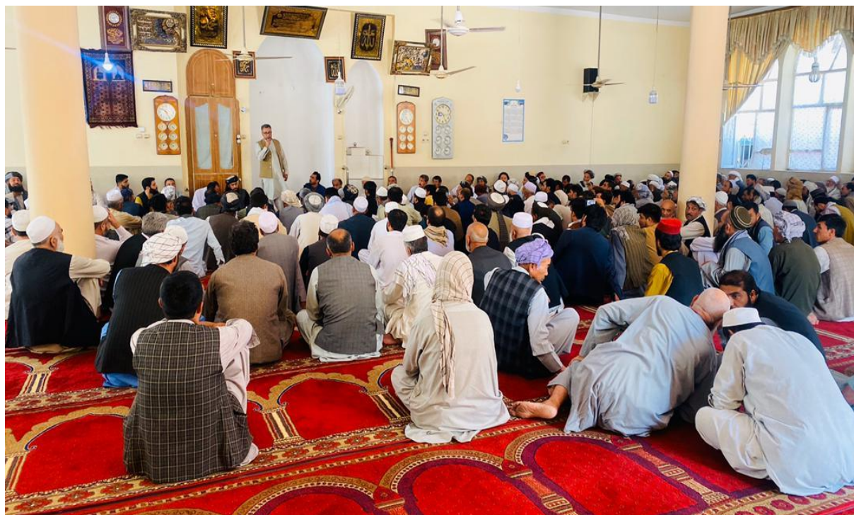
Community consultation session in Mazzar-e- Sharif in September 2022